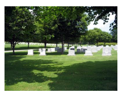
Veterans who wish to be interred at the Vermont Veterans Memorial Cemetery should contact the Vermont Office of Veterans Affairs in Montpelier.